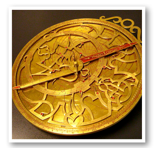
Navigation Technologies: Astrolabe

Write a captain's log entry from the perspective of your explorer outlining the details of your discovery for the king and/or queen. In your entry you must include at least three historically accurate details of the places, things, and people you discovered while on your expedition. In addition, you must include a map of the route of your expedition. Your log will be graded on historically accurate information, use of relevant social studies vocabulary, and general writing conventions. It must demonstrate a solid understanding of your explorer's discoveries on his expedition(s). This log portion of the project is worth 100 points towards both your social studies and writing grades. The map is worth 25